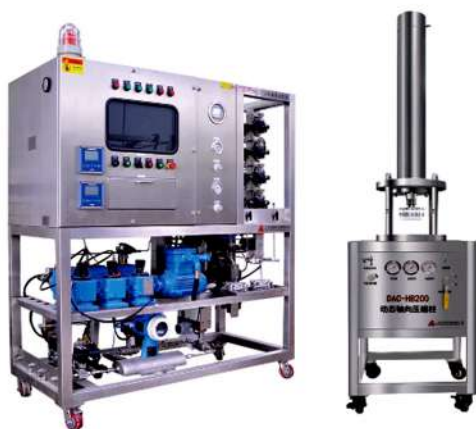
Figure 6: Industrial preparative liquid chromatography system

CS-Prep industrial preparation liquid chromatography system consists of infusion part, sample injection part, detection part, fraction collection part, control and data processing part. The overall design of the equipment complies with relevant regulations such as GMP, cGMP and FDA, and can realize processes such as balance, sample loading, washing, elution, automatic collection, and online cleaning, and can provide verification documents that comply with relevant regulations such as GMP.