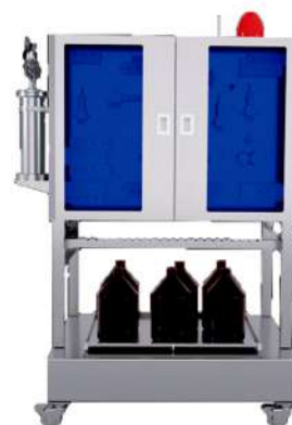
Figure 4: Pilot-scale oligonucleotide synthesis

Bio Oligo Pro 400 pilot-scale oligonucleotide synthesis is an equipment independently developed by Hanbon . for pilot-scale nucleic acid synthesis. The equipment can be used for synthesis of DNA/RNA in the range of 4mmol to 60mmol. Also, for the synthesis of partially modified DNA/RNA, the recommended synthetic sequence is 20bp~40bp. The equipment adopts explosion-proof design, which can meet the general GMP production requirements. It has a compact design and cover a small area, and can be used for pilot scale-up production to meet the needs of batch production of hundreds of grams. The advent of this equipment has solved the gap in this field of domestic equipment to a certain extent, and alleviated the long-term monopoly of imported equipment in this field.