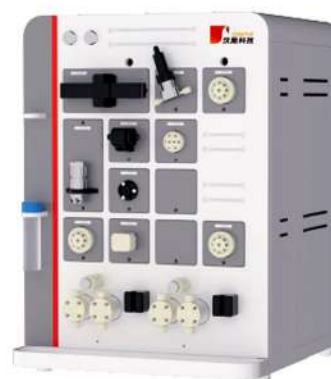
Figure 7: Oligonucleotide purification instrument

Bio-Lab™ laboratory chromatography system is an efficient, fast and reliable automatic chromatography equipment independently developed by Hanbon, applied to the rapid purification of bio-molecules such as peptides and nucleic acids etc. from microgram to gram. The system adopts modular design and intelligent software, and can meet the purification needs of various biological macro-molecules in the laboratory with different specifications of chromatography columns.