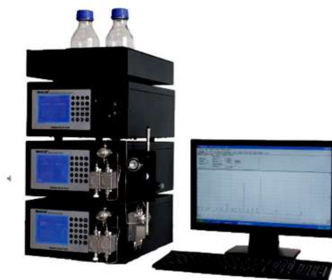
Figure 5: Laboratory HPLC system

The high-performance liquid chromatography system is the equipment that will be used when reversed-phase chromatography is used for purification, and the use of C18 packing material can meet the purification work of laboratory-scale oligo crude products. The high performance liquid chromatography system has also been widely used in the screening of active substances in the research and development of natural medicines, microbial fermentation medicines, peptide medicines, and chemically synthesized medicines. It can prepare milligram-level to gram-level active substances to meet the needs of purification process development.