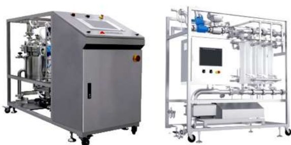
Figure 10: Industrial scale automatic tangential flow filtration system