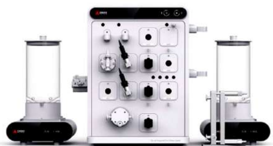
Figure 9: Laboratory scale TFF

Bio-Lab TFF automatic tangential flow filtration system is an easy-to-use automatic UF/DF system, suitable for the research and development of antibodies, vaccines, nucleic acid drugs, etc. in bio-pharmaceuticals and small-scale harvesting, clarification or concentration, and liquid exchange process and so on. It adopts a fully automatic intelligent design, automatically controls TMP, and can realize functions such as automatic concentration, equal volume filtration, automatic collection, and automatic data recording. There are currently two models available, Bio-Lab TFF 30/60/120/180/850 meets the needs of different membrane materials.