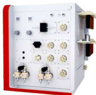
Figure 3: Laboratory oligonucleotide synthesis

Bio-Oligo equipment is an efficient, fast and reliable oligonucleotide synthesis equipment, independently developed by Hanbon Sci & Tech Co. Ltd. At present, this series mainly has two types. Bio-Oligo 10 is mainly used for synthesis in the range of 1 \mu mol to 50 \mu mol, while Bio-Oligo 100 can synthesize DNA/RNA within 50 \mu mol to 9 mmol. The equipment adopts modular design and intelligent software. Combined with synthesis columns of different specifications, it can synthesize certain amount of DNA/RNA, this system can be used for clinical research, nucleic acid drug development and synthesis of molecular diagnostic probes.